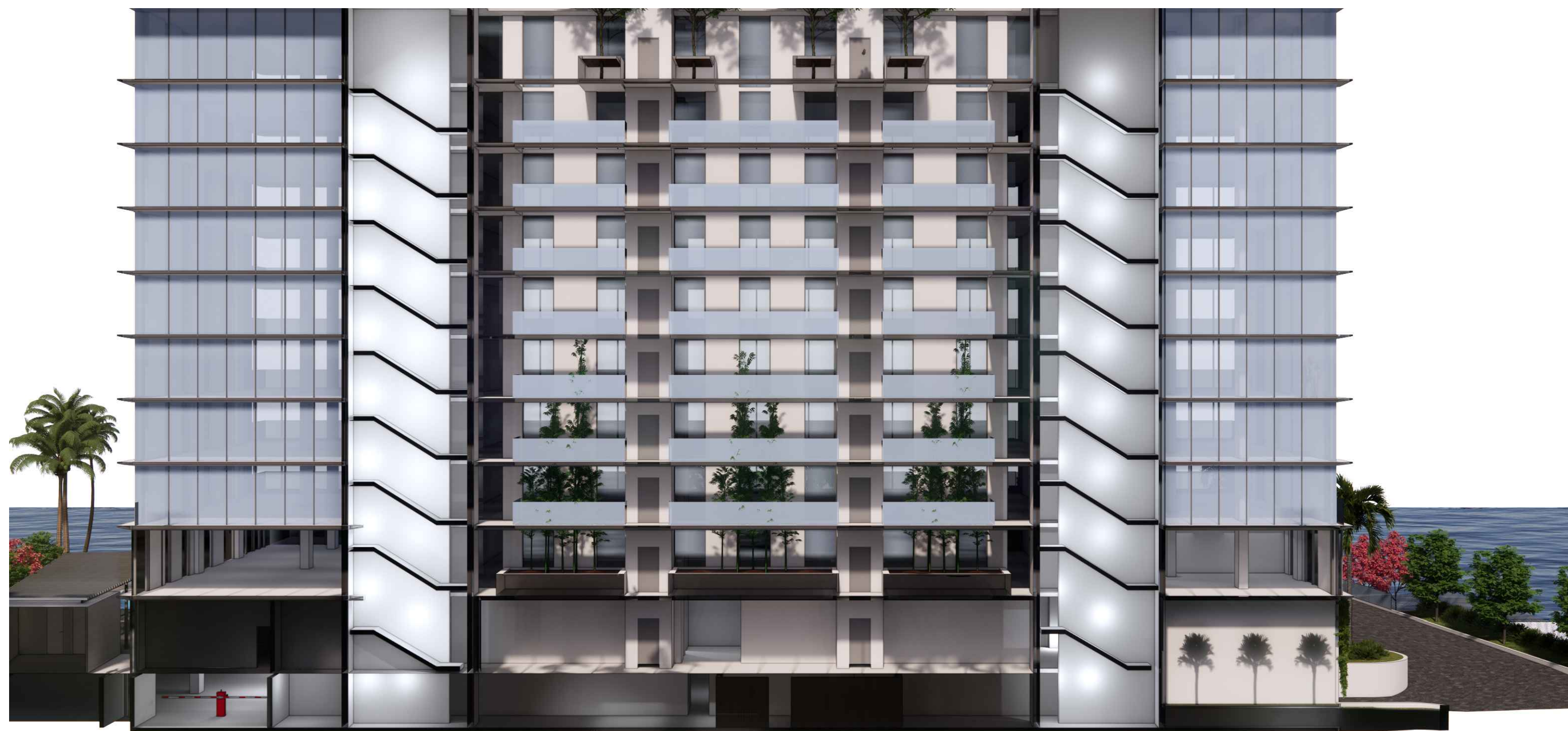
Longitudinal Section looking West (2D) - Staircases