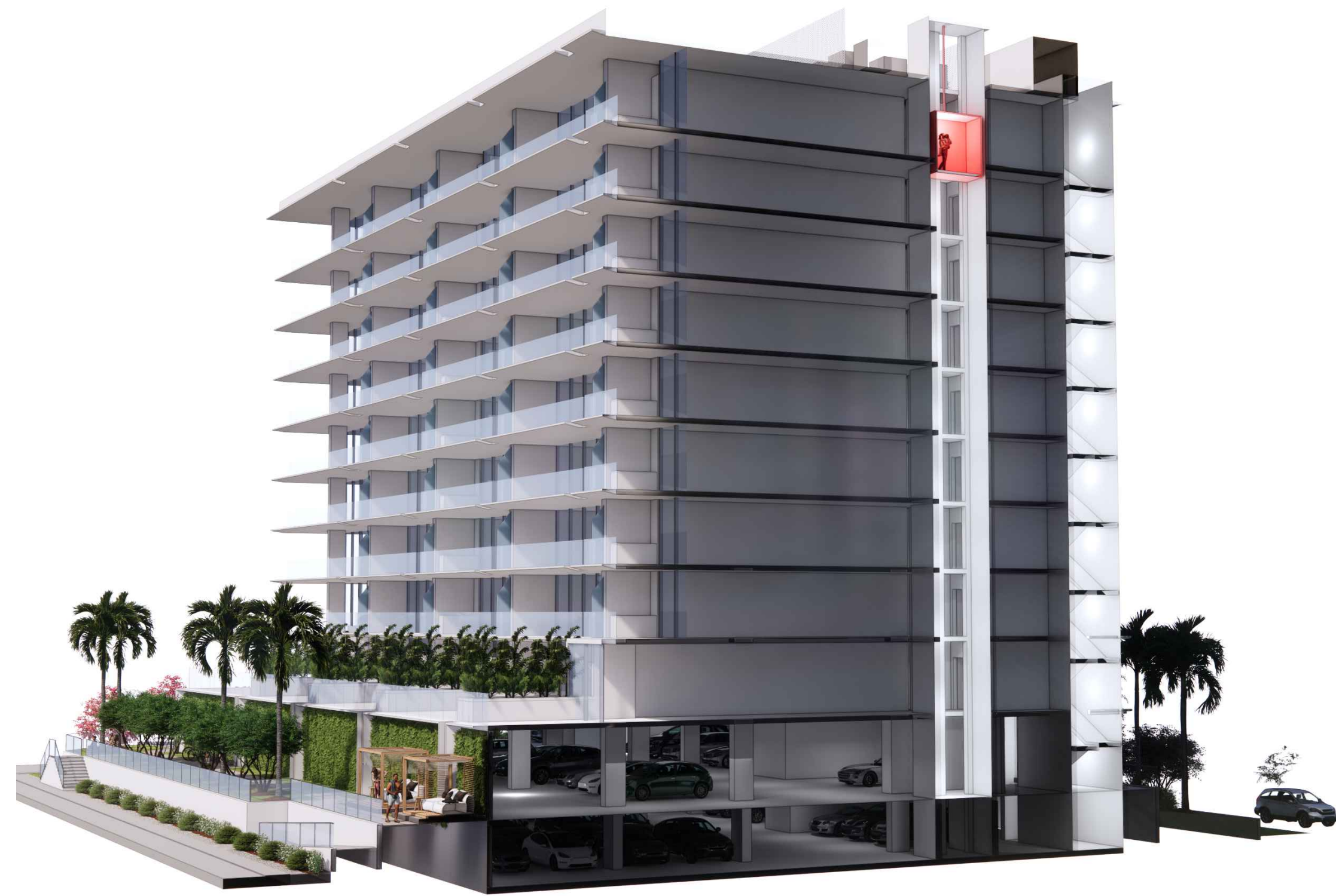
Transversal Section looking North (3D)