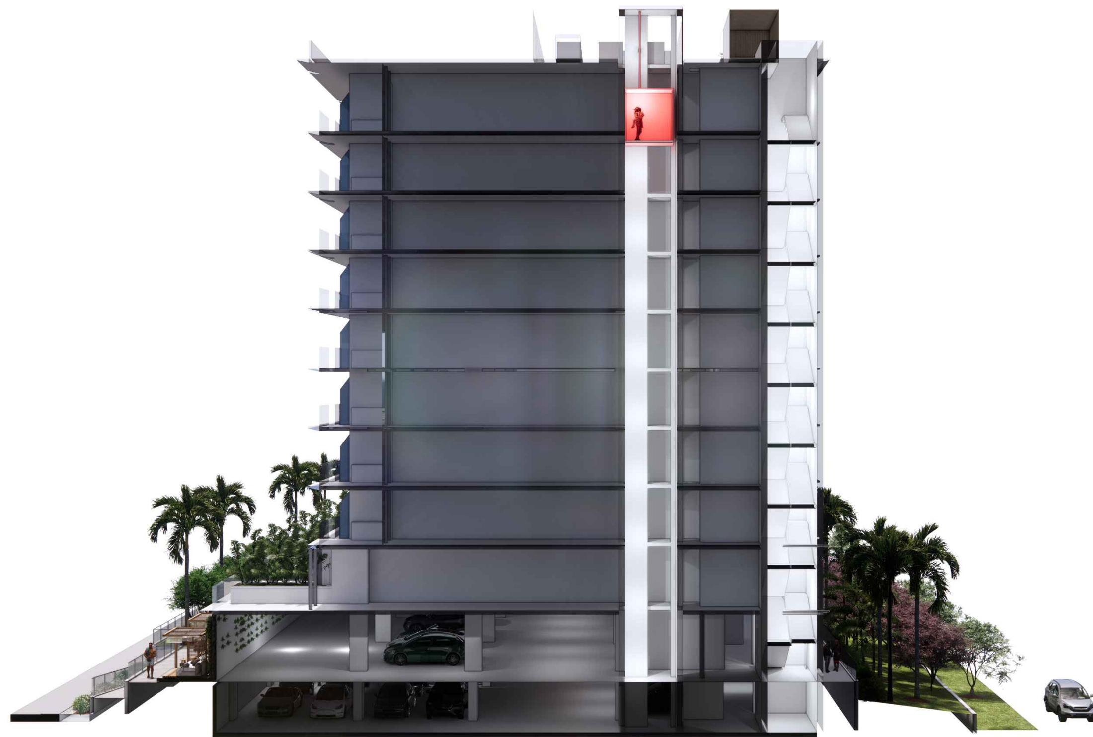
Transversal Section looking North (2D)